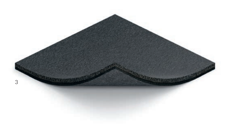
Fig. 3: Linoleum which is approximately 2.5 mm thick with an untreated, slightly coarse, justrous matt surface